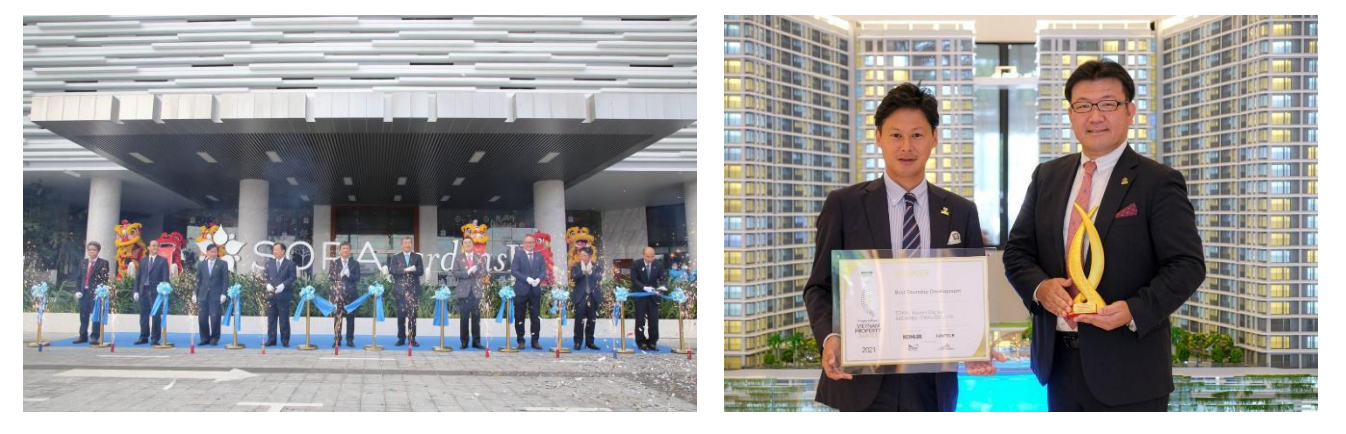
SORA gardens II Completion Ceremony

"SORA gardens II", a condominium project with MITSUBISHI ESTATE RESIDENCE Co., Ltd which was completed in May, 2021, after the long social distancing period due to the COVID pandemic effect, has finally welcomed to hold the completion ceremony on December 28<sup>th</sup>, 2021. More residents are seen to be enjoying the new life in Binh Duong New City soon.