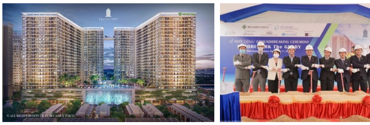
MIDORI PARK The GLORY Overview

"MIDORI PARK The GLORY" is a condominium project which consists of 24-floor buildings with 992 high quality apartment units expected to be completed by spring 2024, followed by handover. With the concept of "Large-scale residence for the upper-middle class customers who want to spend relaxing time with their families", BECAMEX TOKYU is developing a building that has "a variety of common facilities" as well as the "elegant design".