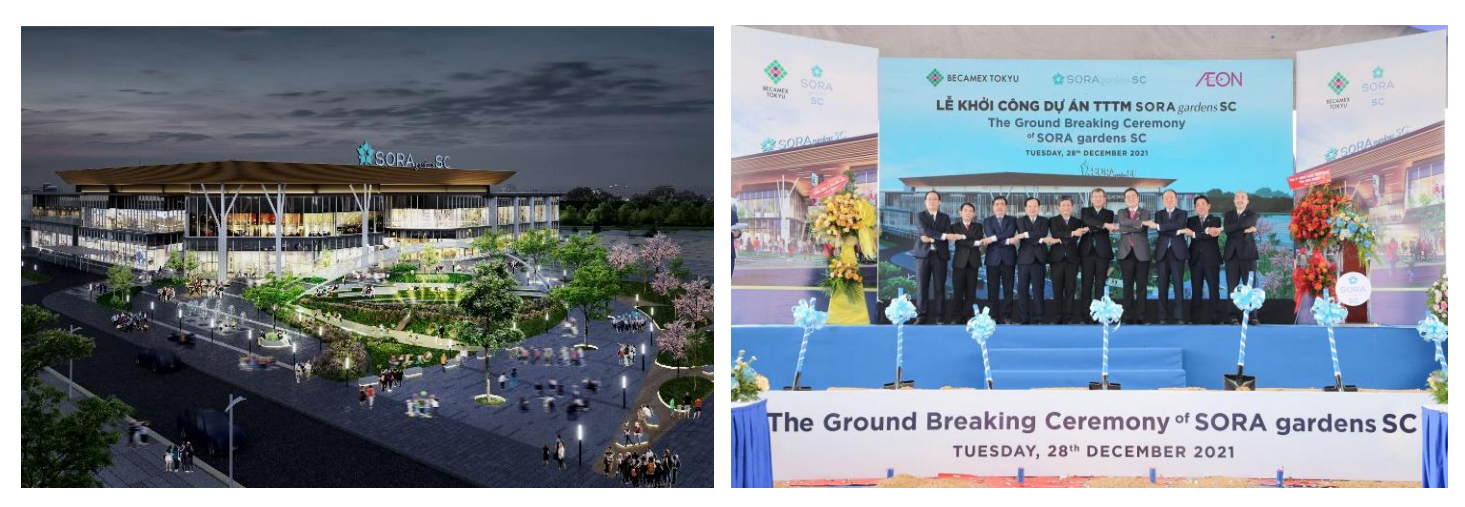
SORA gardens SC Overview