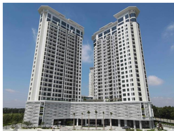
▲ SORA gardens II from the outside

The highlight of this project is that it “provides community facilities targeting for new generation families with kids”, and is “the first project in Binh Duong to equip smart home system to all units”. Commercial facilities are designed on the ground floor, and the common facilities are on the 4th floor, which include a 25m swimming pool, a BBQ terrace, kids' playground, sauna, guestroom, etc. This is also the first project in Binh Duong to equip smart home system to all units, which enables the owner to control the door, or the electric household appliances on their smartphones. Approximately 90% of the units, mainly 2 bedrooms, average price around 3 billion VND are sold out. The majority of customers are high-end Vietnamese and foreigners.