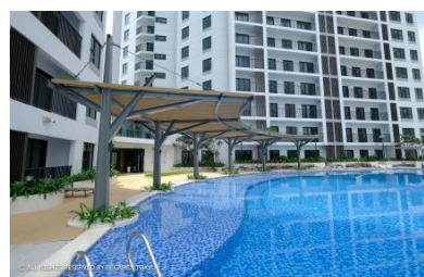
▲Swimming pool for the residents