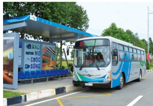
▲ KAZE SHUTTLE

(Operated by BECAMEX TOKYU BUS CO., LTD.)