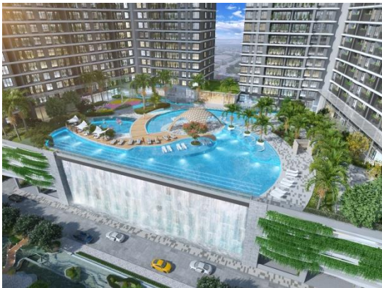
▲ Extended community area(swimming pool for the residents)