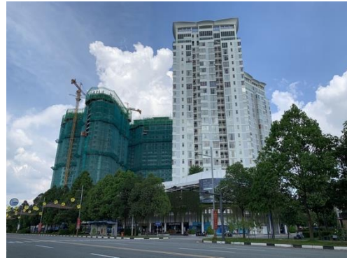
▲ SORA gardens I and SORA gardens II

Number of floors: 24 floors Completion: March 2015