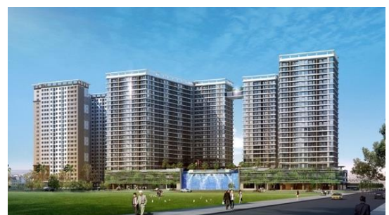
▲ Perspective from the outside of the project

NTT Urban Development has participated in many real estate projects in the UK, the USA and Australia. This is the first project launched in Asia, and the Corporation aims to expand their business in the South East Asia market. Moreover, as an activity of NTT Group, in March 2018, NIPPON TELEGRAPH AND TELEPHONE EAST CORPORATION signed a MOU of cooperation with BECAMEX IDC CORPORATION in fields of