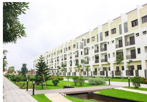
▲ MIDORI PARK HARUKA

Completion: Periodic construction since July 2017