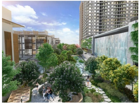
▲ Green area developed integrally with the Project