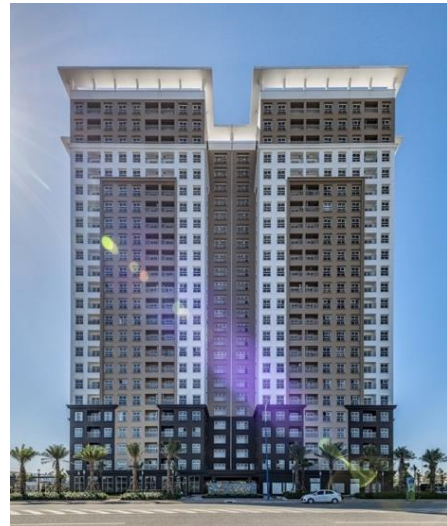
▲ MIDORI PARK The VIEW

※ Joint ventured with Mitsubishi Estate Residence.