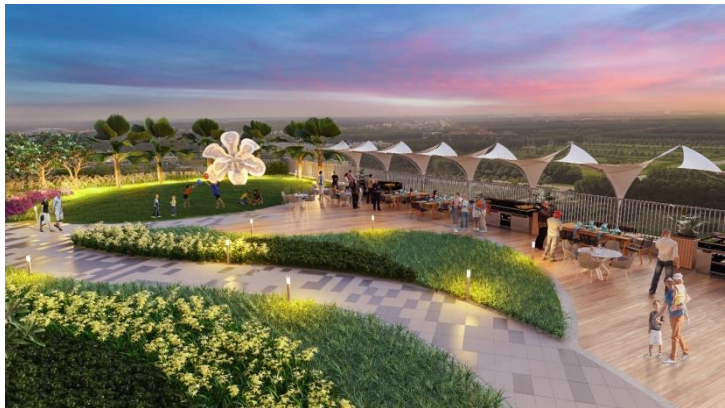
▲ Extended community area(BBQ terrace)