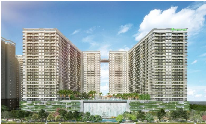
▲ From the outside(overall)